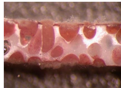
Cross section with biofilm