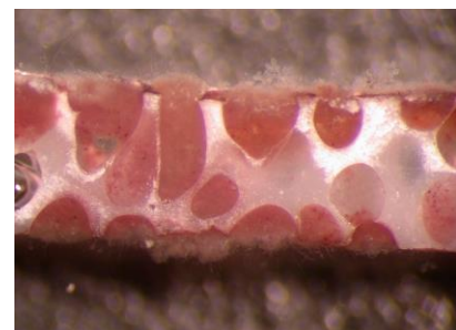
Cross section, with biofilm