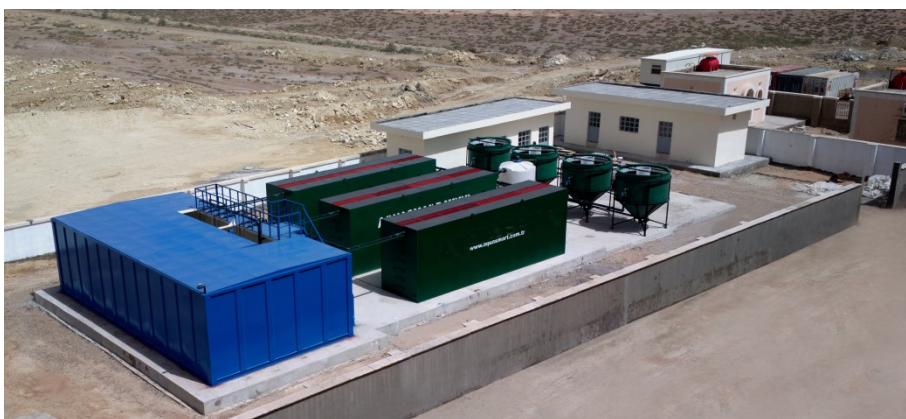
Fig 5: Containerized wastewater treatment plant operated with Mutag BioChip™, installed in Iraq in 2014

As outlined above, the treatment capacity of existing wastewater treatment plants is possible to be significantly enhanced simply by adding Mutag BioChip 30™ carriers. With regard to this, also containerized wastewater treatment plants, which are complete units from the conceptual point of view, can reach significantly higher treatment efficiency by using the high-performance biofilm carriers.