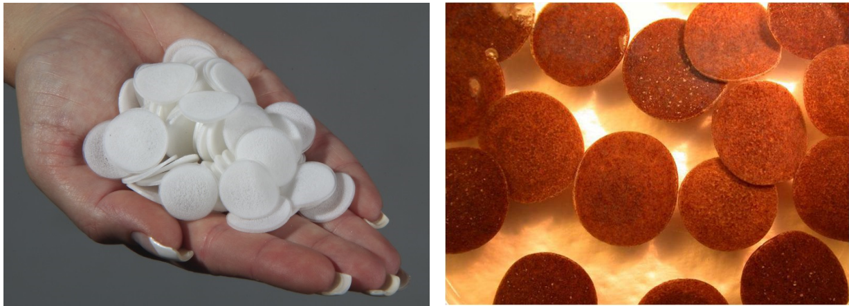
Fig. 1 and 2: Mutag BioChip™ high-performance carrier media for biofilms – uncolored, w/o biofilm (white) and colored, w/o biofilm (orange)

In the following, it will be explained by taking the example of the Swiss-based municipal sewage treatment plant (STP) called "oberes Surbtal" how relatively easy it is to significantly enhance the nitrification performance of existing STP's by applying Mutag BioChip™ carriers. The Mutag BioChip™ is the predecessor of the Mutag BioChip 30™.