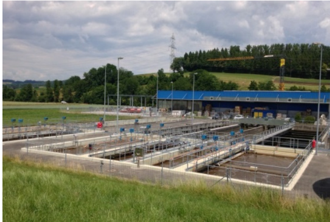
Fig. 3: Sewage treatment plant "oberes Surbtal". The biological treatment part of the plant consists of three identical treatment trains

The biological treatment stage of the STP consists of three identical trains whereas each train comprises three treatment zones. Within the scope of the reconstruction measure, the respective nitrification zone of each treatment train was equipped with Mutag BioChip™ high-performance biofilm carriers.