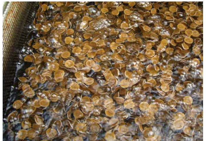
Fig. 4: Nitrification by means of Mutag BioChip™ RAS Process in a fish farm

BioChip™ 7.3% (44 litres). At the beginning of February 2010, the initially low supply with fish food was adapted to the very low water temperature of 10°C while the temperature-dependent growth of the nitrifying bacteria on the carrier surface took several weeks. The activity of the biofilms could be observed to increase accordingly to the rising temperature and the correspondingly augmented food supply. In the MBBR using the Mutag BioChip™ RAS Process the NH 4 concentrations accounted permanently for 0.1 to 0.2 mg/L at water temperatures of 21°C in average and 25°C in peak while the daily food supply was 500 g. Since in those trials only the nitrification performance was observed and due to no second MBBR installed for de-nitrification, in order to keep the NO 3 level low enough to prevent damage to the fish the water exchange was kept between 5 and 15 % of the system per day. The specific NH 4 removal rates provided by the Mutag BioChip™ carrier were measured to be up to 0.24 kg NH 4 -N/m 3 of media per day whereas the biomass immobilized on the carriers in both MBBR tanks was identical despite the lower media filling level in the tank using Mutag BioChip™.