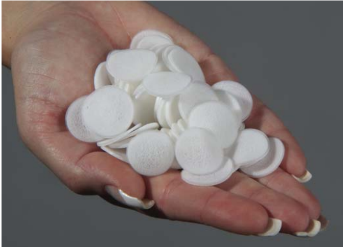
Fig. 3: Carrier medium Mutag BioChip™ (3,000 m 2 /m 3 )

microorganisms colonizing the surface of the carrier media and therefore establishing a thin biofilm while the single carriers can move freely in the water and are kept in suspension either by process air provided by tube aerators installed at the tank bottom or by mixers. In the first, aerated MBBR tank the nitrifying microorganisms immobilized on the carrier surface transform the ammonium nitrogen (NH 4 -N) to nitrite (NO 2 ) and subsequently to nitrate (NO 3 ). This process is called nitrification.