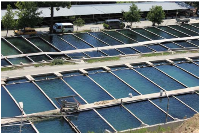
Fig. 1: Fish farm

Due to the supply with food, the water is permanently contaminated with organic components and nitrogenous compounds from the natural excrements of the fish. In open-cycle installations, the contaminated water is conducted out of the system and replaced by fresh water, while there is only little fresh water conveyed to closed-cycle installations; the majority of the water available in this type of system is treated and subsequently returned to the breeding tank. Due to the permanent transfer of water from the breeding tank to the treatment tanks and back, this particular type is called recirculating aquaculture system, briefly RAS. Taking into consideration the increasing scarcity of water in many parts of the world as well as the increasingly stringent regulations imposed by authorities and the current quality requirements to food fish, those closed systems are ecologically and economically useful alternatives compared to open-cycle aquaculture installations, whereas they have to comply with the highest requirements in terms of the applied technologies and notably of the water quality.